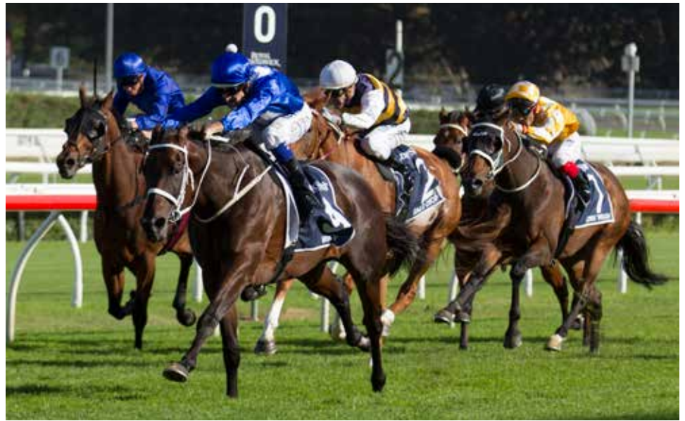
Queen Elizabeth Stakes, 2018