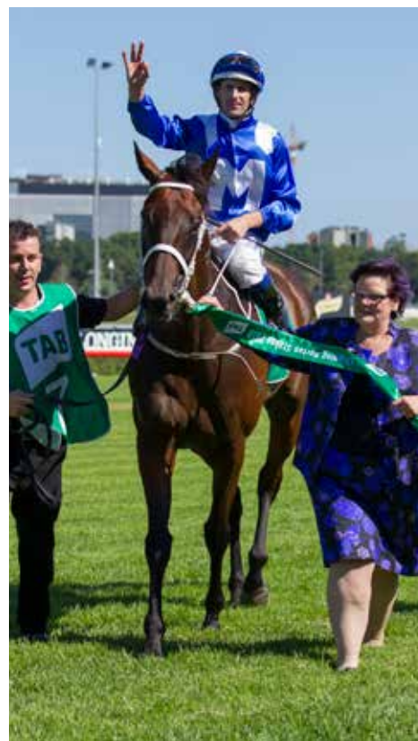
Chipping Norton Stakes, 2018