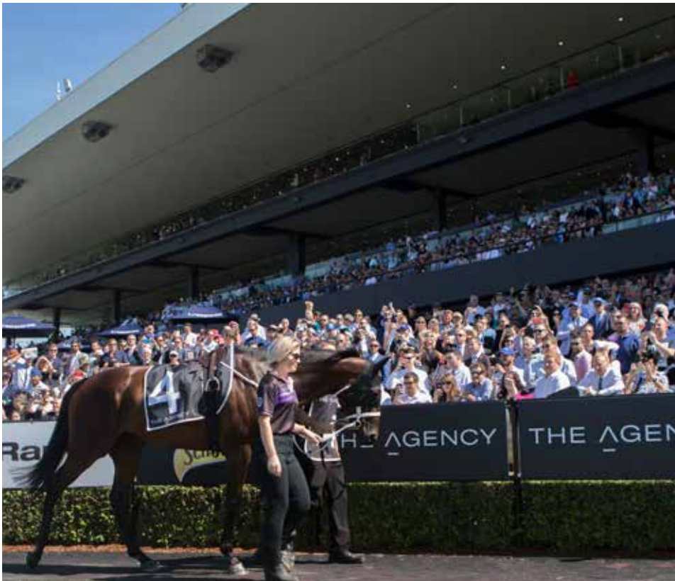
George Ryder Stakes, 2017