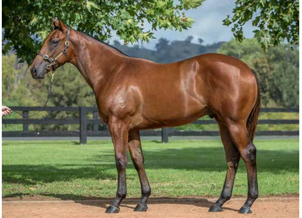
Lot 88 Fastnet Rock - Legally Bay is one of the popular lots of Inglis Easter Yearling Sale

"And if you're out there looking to bring it closer to one in every 243 people, you'll have lots to choose from in the next two days."