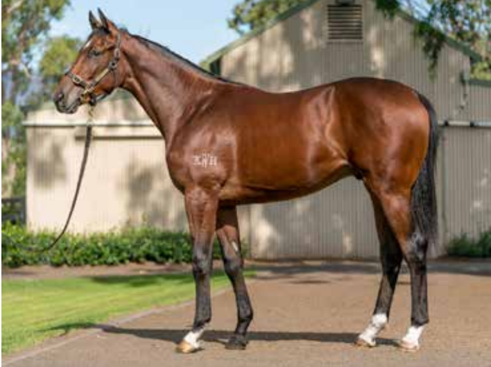
Lot 110 Vancouver - Marianne colt