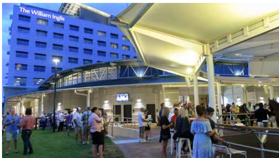
Inglis' Warwick Farm sales complex

Global buying bench leads to record inspections at company's number one auction