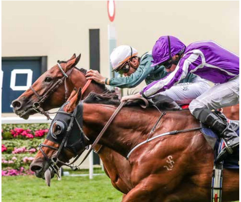
Merchant Navy wins the Diamond Jubilee Stakes at Royal Ascot

"Aushorse has released an Investors' Guide [click here: ow.ly/lvaR50pbAfP ] on the eve of