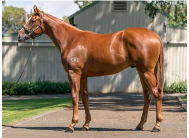
Lot 26 Snitzel - Gallant Tess colt

Kitchwin Hills will offer two colts by Australia's champion