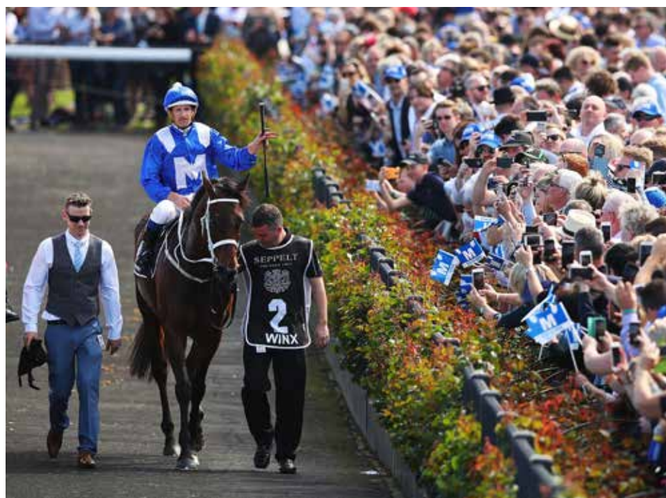
Turnbull Stakes, 2017