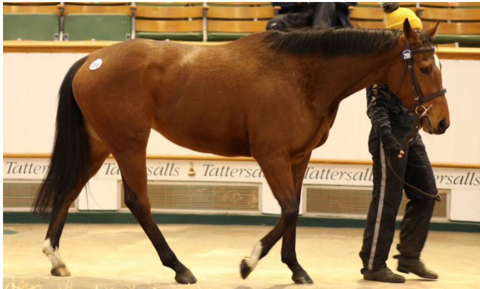
Lot 2195: Banmi

The four-day December Mares Sale concluded with turnover of 43,111,900gns (approx. AUD$82,000,000), down 25 per cent; an average of 58,655gns (approx. AUD$111,500), down 32 per cent; and a median of 20,000gns (approx. AUD$38,000), which was down 26 per cent on the 27,000gns generated last year.