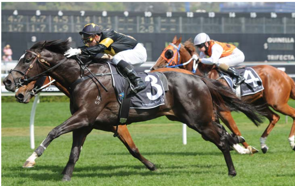
Better Than Ready

Four-year-olds now eligible for lucrative Queensland breeder incentive as prize-money also increased